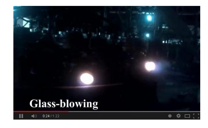
Repression ** C

Hereby watch our production line video online, welcome to visit us on site.