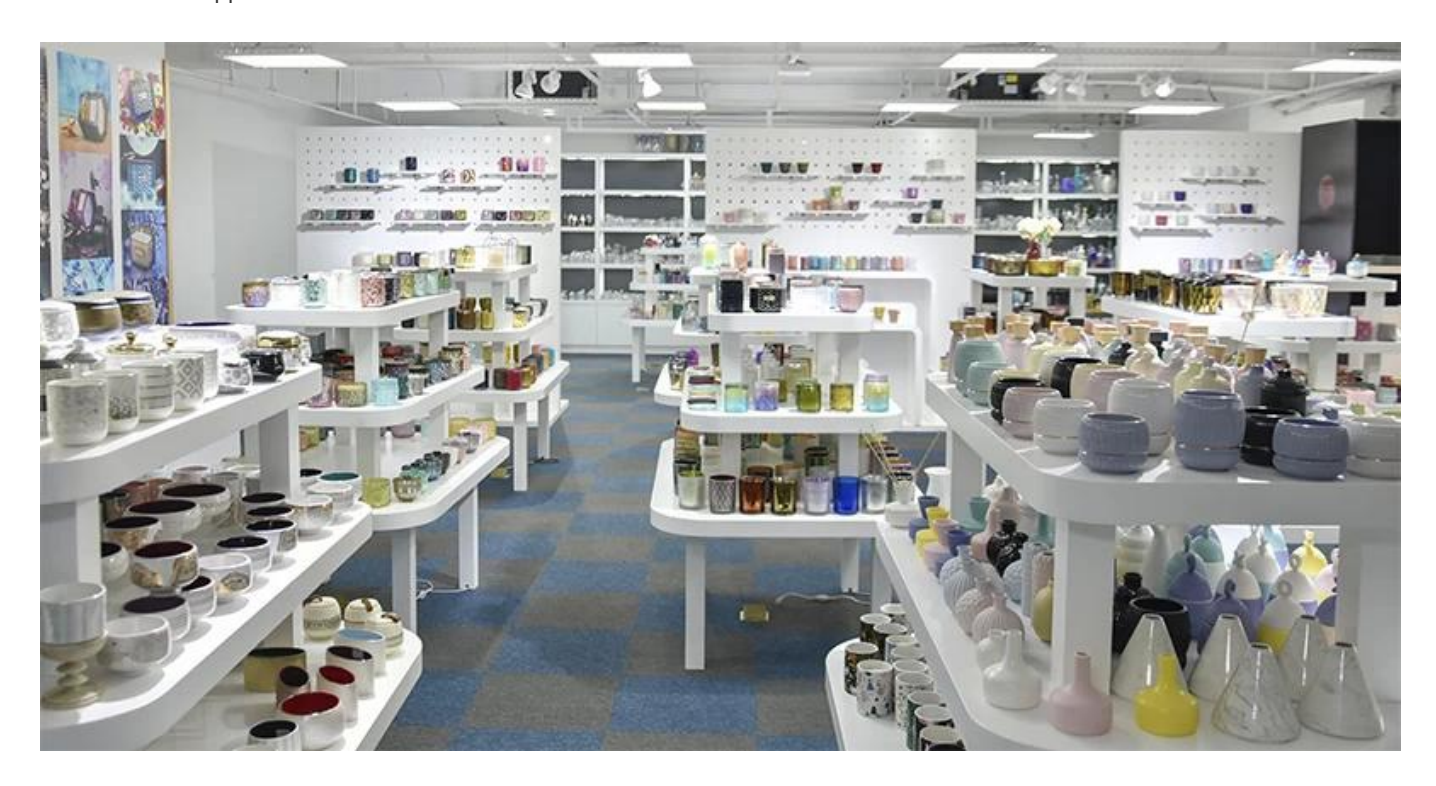
Glass Production Craft

The existence of Sunny Glassware exceeds Shenzhen sample room has 5000 pieces Wide choice. It won a lot of affirmation <u>Customer evaluation</u>. Welcome to the Shenzhen office! As shown below Only part of the design candlestick we have Welcome to the Shenzhen office to find your favorite, it will bring you a big surprise, because it is difficult to find such another supplier in China.