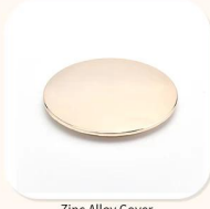
Zinc Alloy Cover