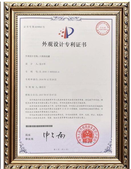
Patent Number: 201630655323.4