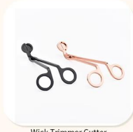
Wick Trimmer Cutter