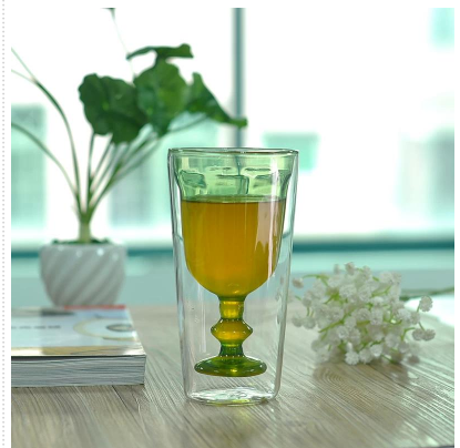
Borosilicate double wall drinking glasses