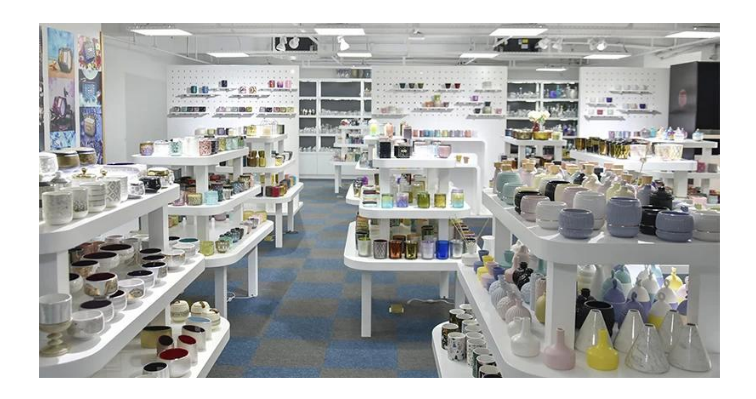
package & shipment