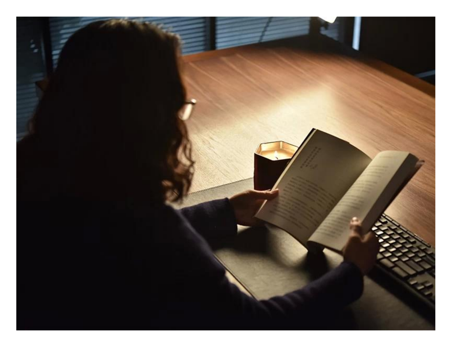
Sunny Brand Story