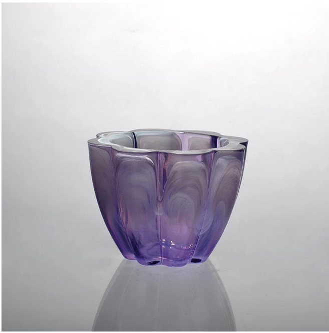
Color painting candle holder