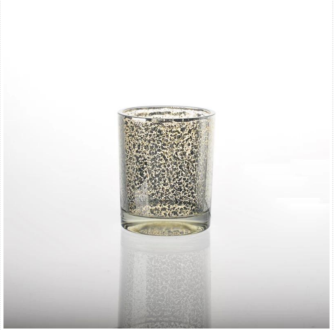
Sprayed candle holder