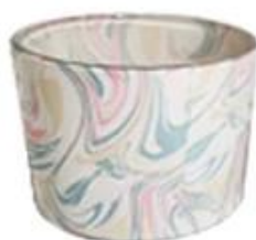
Water Transfer Printing