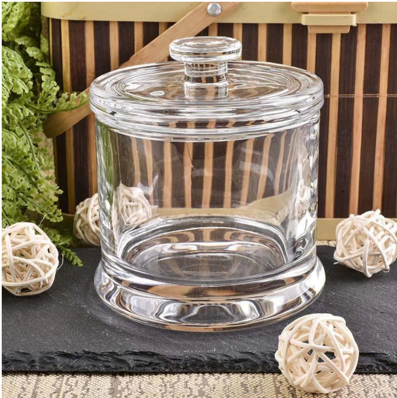
Candle lids accessories: