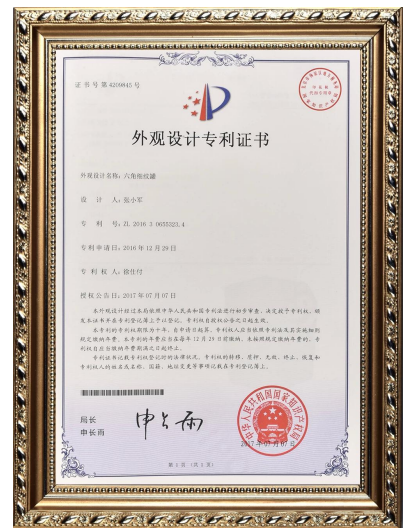
Patent Number: 20163065532.4