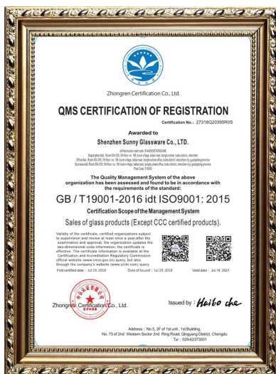
ISO 9001: 2015