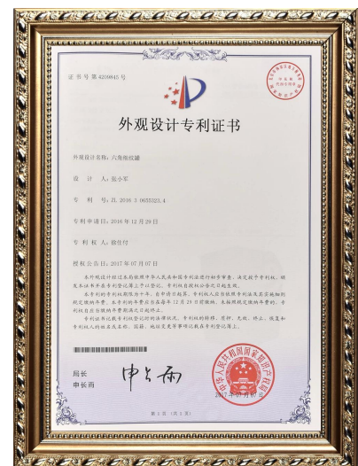
Patent Number: 201630655323.4