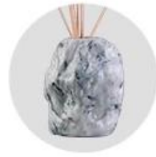
Water Transfer Printing