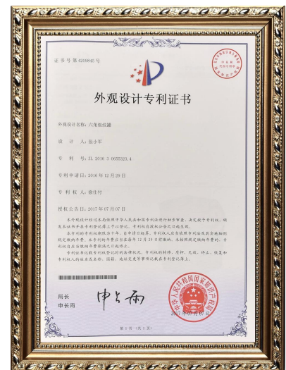
No. : 201630655323,4 patentowy