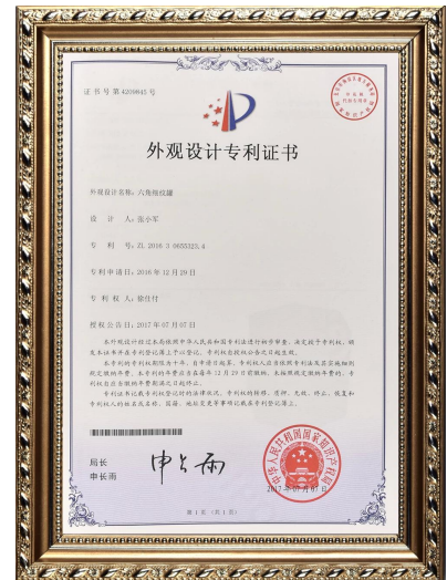
Nr patentowy: 201630655323.4