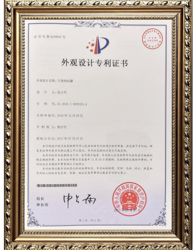
Numer patentowy: 20163065532.4