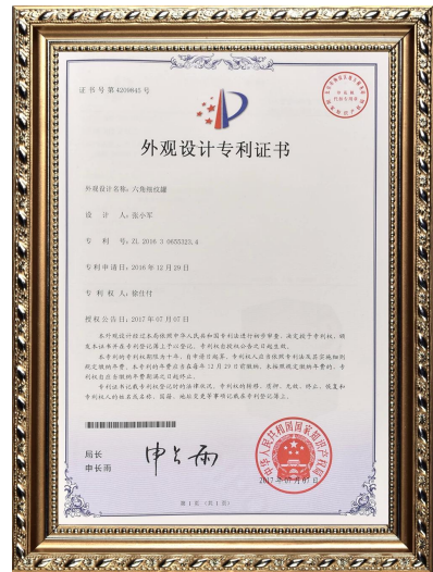
Numer patentowy: 201630655323.4