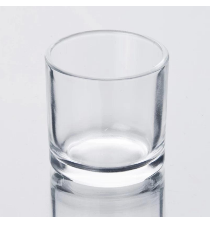
shot glasses wholesale