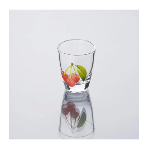
printing shot glass