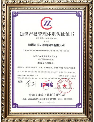
Własność intelektualna przedsiębiorstwa