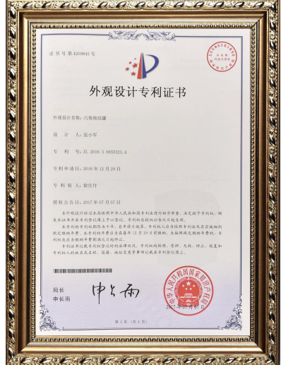
Numer patentowy: 201630655323.4