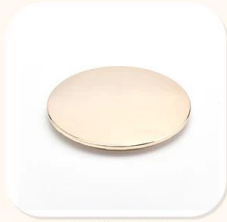
Zinc Alloy Cover