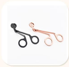
Wick Trimmer Cutter