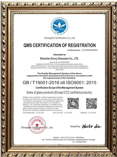
ISO 9001: 2015