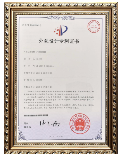
Patent Nr.: 201630655323.4