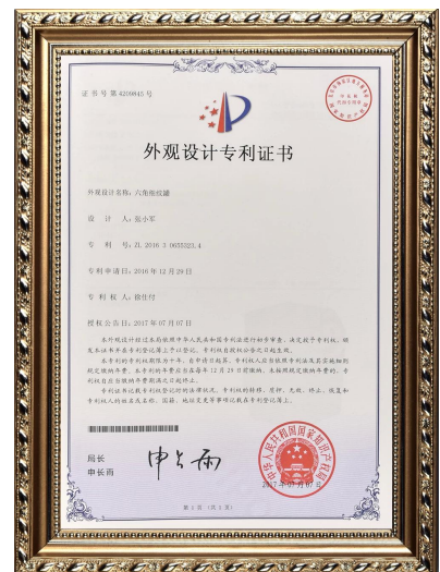
Numer patentowy: 201630655323.4