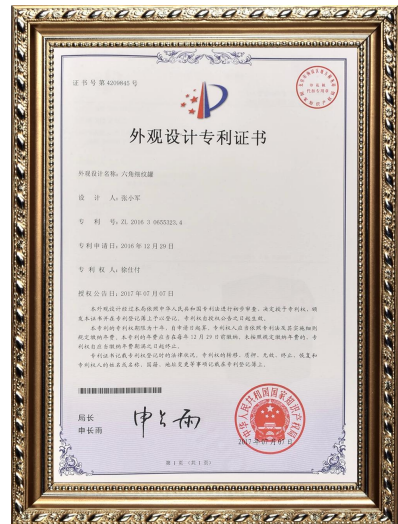
Numer patentowy: 201630655323.4