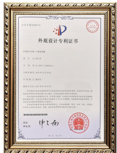
Numer patentu: 201630655323.4