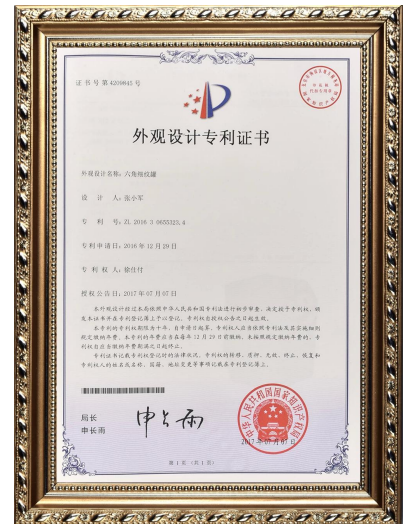
Numer patentowy: 201630655323.4