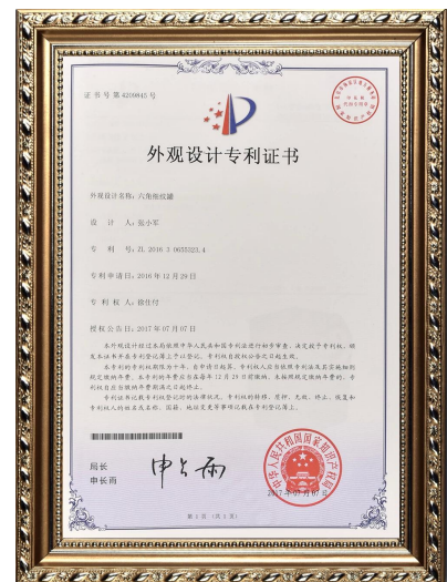
Numer patentu: 201630655323,4