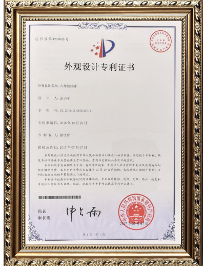
Numer patentowy: 201630655323.4