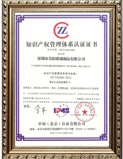
Firma właściciości intelektualne