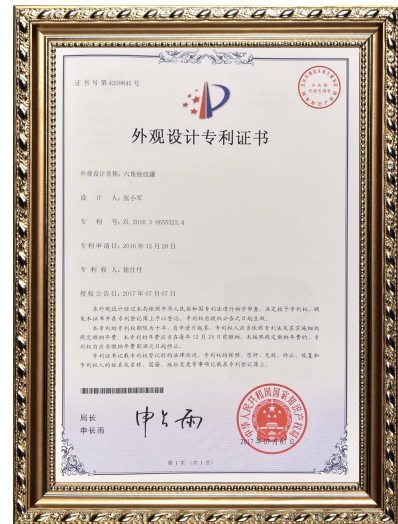
Numer patentowy: 201630655323.4