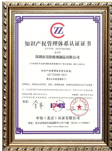
Firma właścności intelektualne