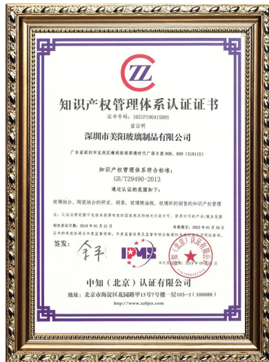
Firma właściciości intelektualne