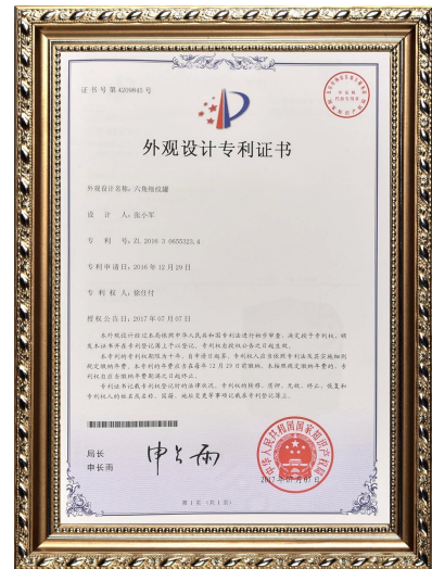
Numer patentowy: 20163065532.4