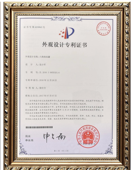
Patent Number: 201630655323.4