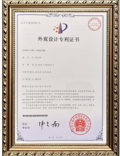
Numer patentowy: 20163065532.4