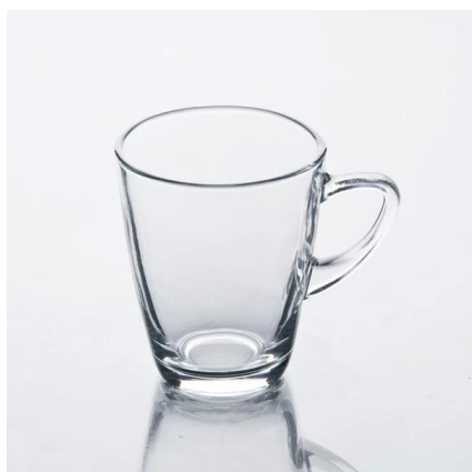
hight white glass mug