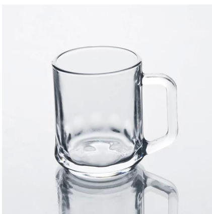
clear water glass mug