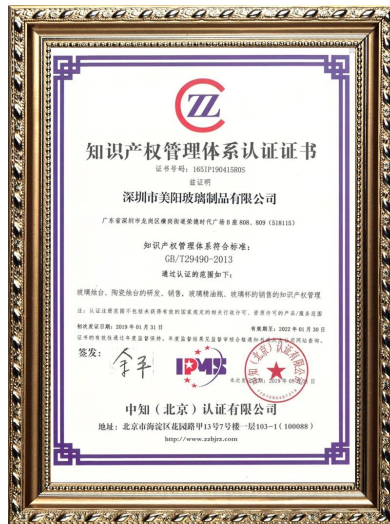
Hartanah Intelektual Syarikat