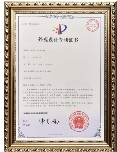
Nombor Paten: 20163065532.4