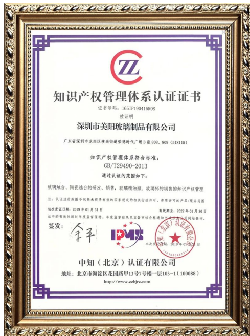
Harta Intelek Perusahaan