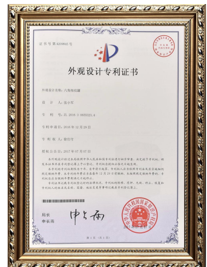
Nombor Paten: 201630655323.4