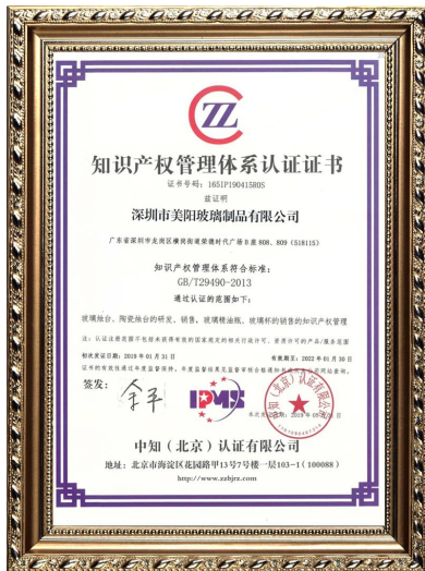
Harta intelek perusahaan