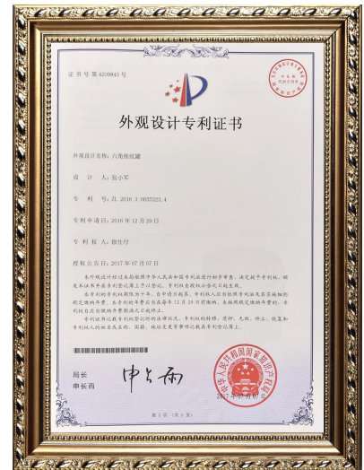
Nombor Paten: 201630655323.4