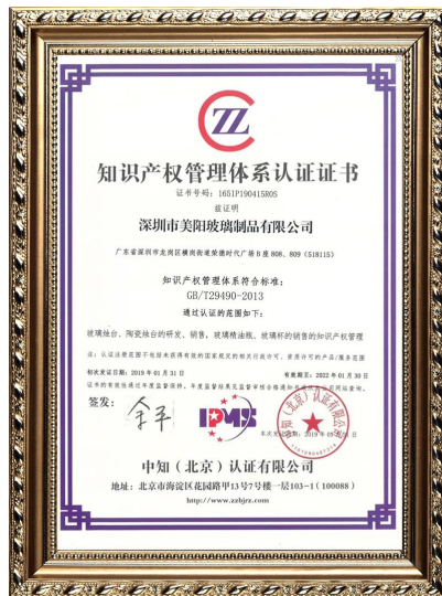
Harta Intelek Perusahaan