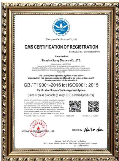
ISO 9001: 2015