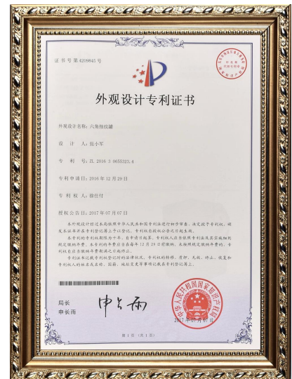
No. Paten: 201630655323.4