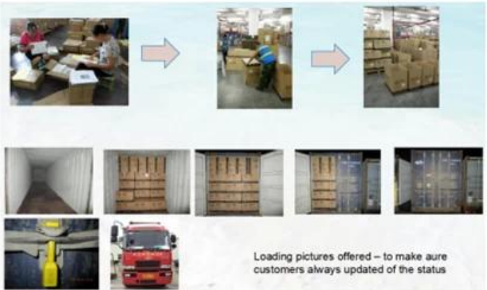
Loading pictures offered – to make sure customers always updated of the status