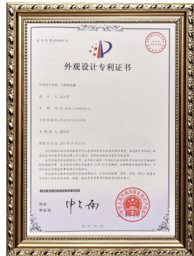
Nombor Paten: 20163065532.4