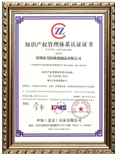
Harta Intelek Perusahaan