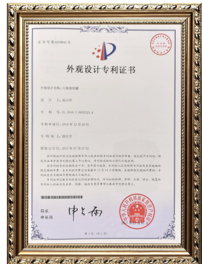
No. Paten: 201630655323.4