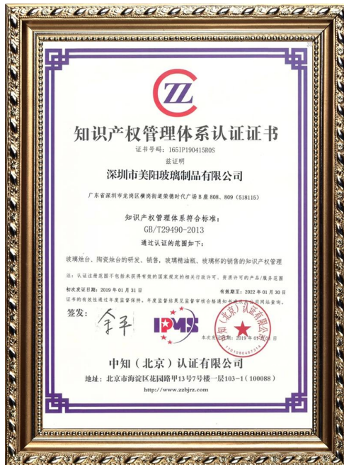
Harta Intelek Perusahaan