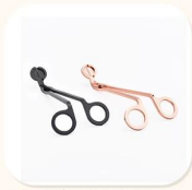
Wick Trimmer Cutter

Makan malam hiasan di bar atau bar Sesuai untuk keluarga, hotel atau taman Hadiah Kekasih Khas Sebarang peluang hiasan