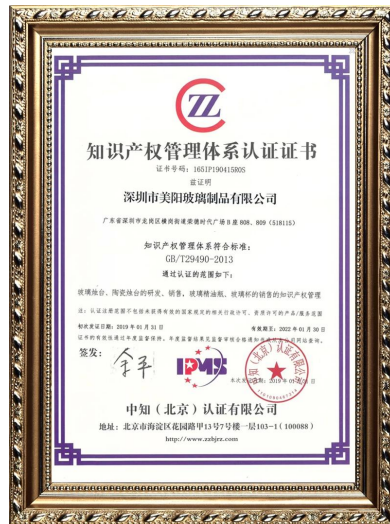
Harta intelek perusahaan