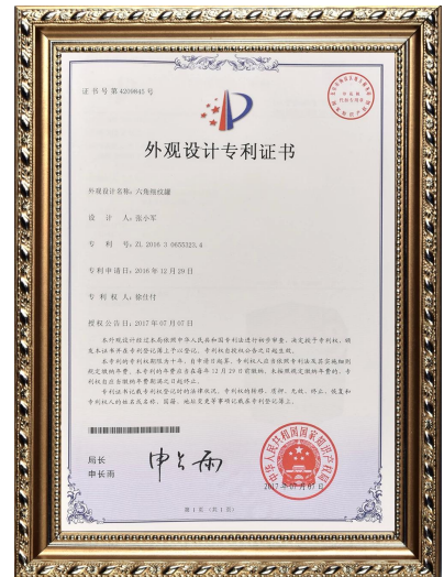
Nombor Paten: 20163065532.4