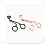
Wick Trimmer Cutter

Makan malam hiasan di bar atau di bar Sesuai untuk keluarga, hotel atau taman Hadiah Kekasih Khas Sebarang kemungkinan hiasan