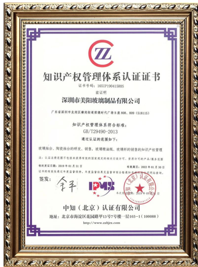
Harta intelek korporat