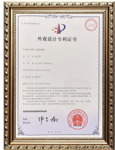
No. Paten: 201630655323.4