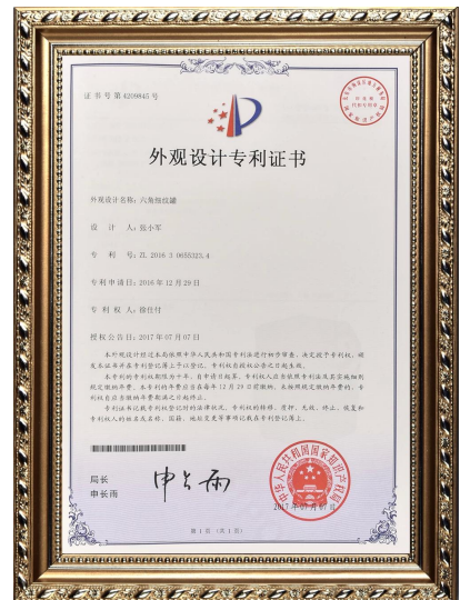
No. Paten: 201630655323.4