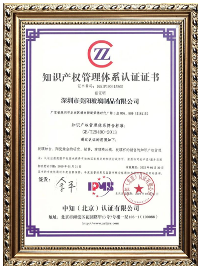
Harta Intelek Perusahaan