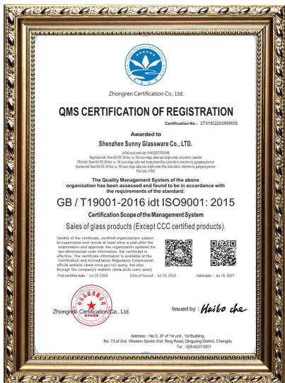
ISO 9001: 2015