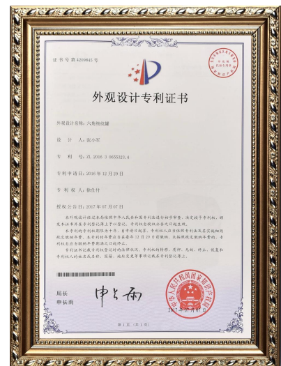
Bilangan paten: 201.630.655.323,4