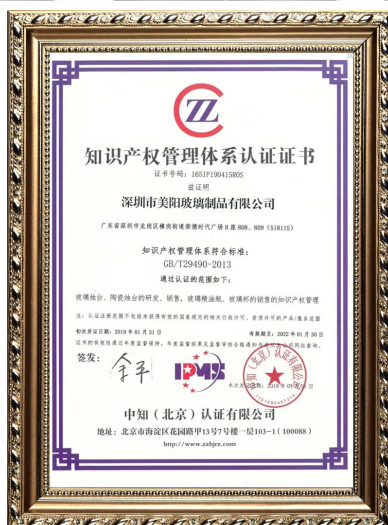
Harta Intelek Enterprise.