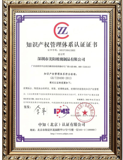
Harta Intelek Perusahaan