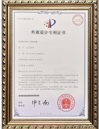
Nombor Paten: 201630655323.4