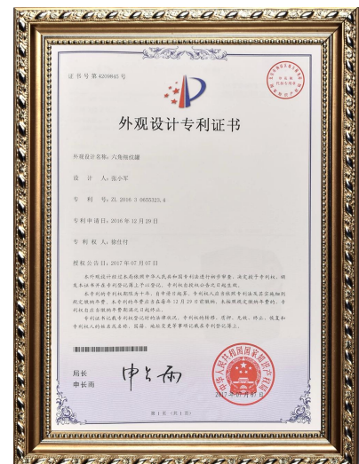
Nombor paten: 201630655323.4