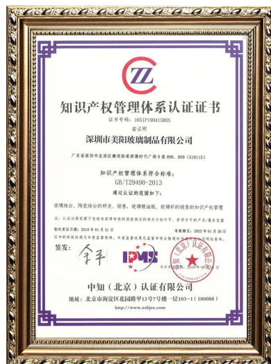
Harta Intelek Enterprise.