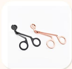
Wick Trimmer Cutter