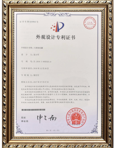
Nombor Paten: 20163065532.4