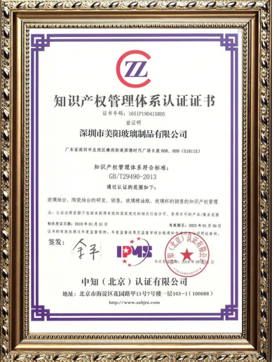
Harta intelek perusahaan