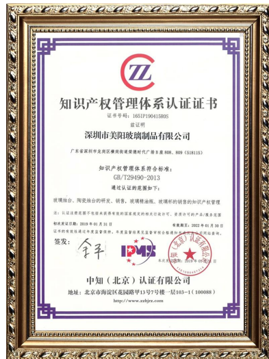
Harta intelek perusahaan