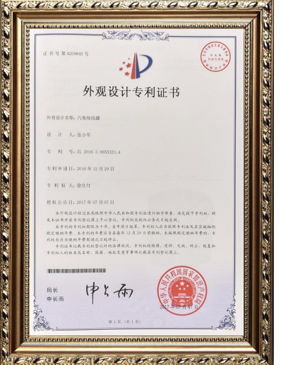
Nombor Paten: 201630655323.4