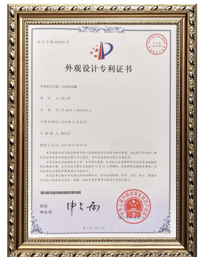
Nombor Paten: 201630655323.4