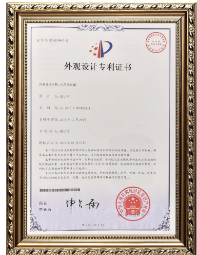
Nombor Paten: 201630655323.4