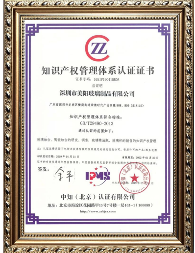
Harta intelektual perusahaan