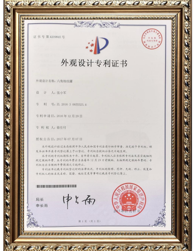
Nombor Paten: 20163065532.3